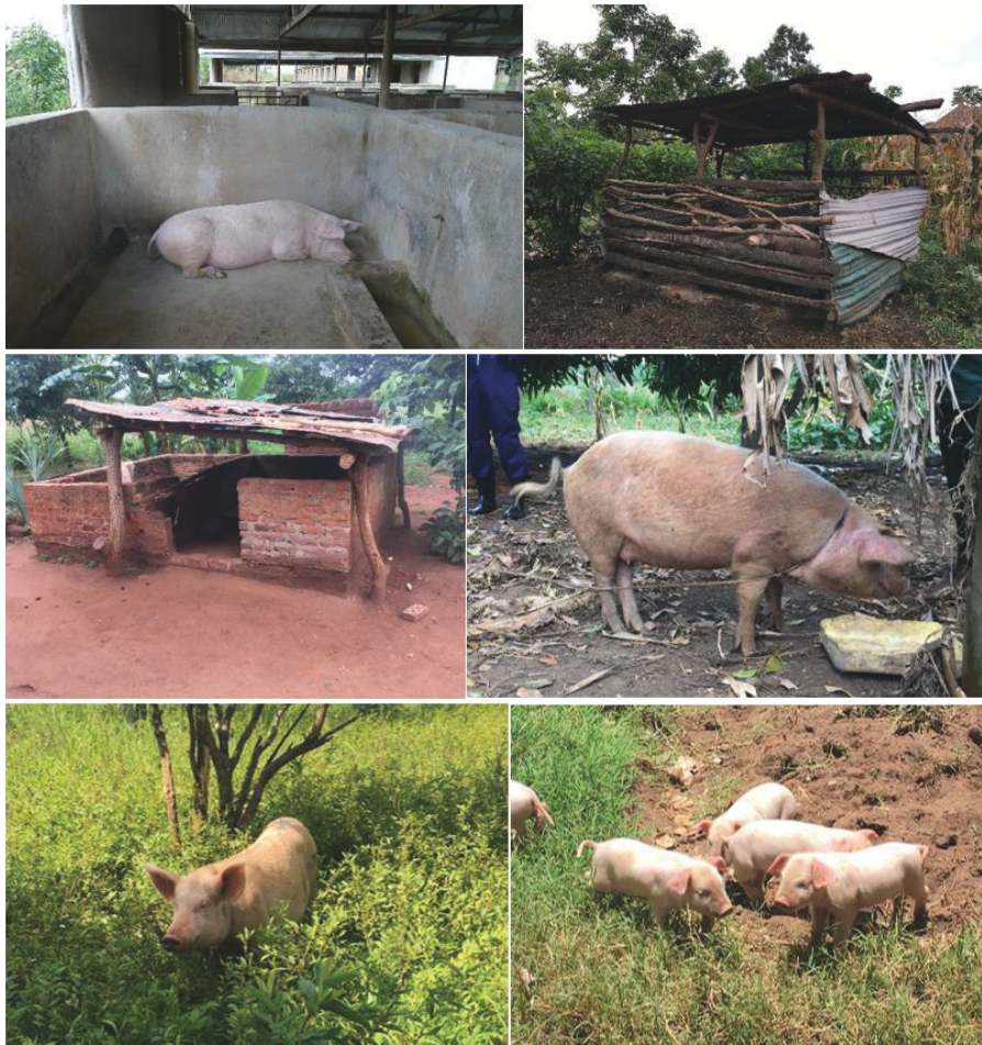
Figure 1. Different rearing conditions in Lira, Uganda.

weeks (Dione et al. , 2014b; Ouma et al. , 2014). On the contrary, a study from Kenya found that castration was mainly performed after the age of 4 weeks (Kagira et al. , 2010). Castration is most often performed by a hired person, and not by the farmers themselves (Dione et al. , 2014b). Teeth cutting is not a common practice (Dione et al. , 2014b; Biryomumaisho & Ogalo, 2007). Administration of iron is generally not routinely performed, instead some farmers let their pigs scavenge in order to ingest red soil as an iron booster (Dione et al. , 2014b). As previously stated, farmers themselves regard lack of knowledge on management practices as a limitation to the animal health (Dione et al. , 2014b).