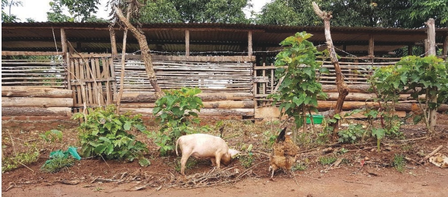
Figure 3. A stray pig and a chicken outside a confined herd.

Biosecurity was generally lacking (Fig. 3). While six farmers confined all their pigs, 16 herds mixed their pigs with others during service, and only two herds never had contact with foreign pigs. The use of quarantine for newly acquired pigs was uncommon. Some farmers claimed to use disinfectant boot baths, but these were either not used in practice or used without prior cleaning of the boots. Age segregation was observed in one herd only, and all in-all out was not practiced. On the other hand, the pig density for the confined pigs was generally low, as compared to e.g. Swedish legislation (Statens jordbruksverks föreskrifter och allmänna råd om grishållning inom lantbruket m.m., SJVFS 2019:20, Swedish Board of Agriculture, 2019), and the confinements were often reasonably clean from visible feces. However, the pens were seldom cleaned with water and detergents, and were rarely disinfected. In many cases such procedures were not practically possible, due to e.g. earth flooring or poor constructions, but it might also have been due to the lack of knowledge or money (Nantima et al. , 2016).