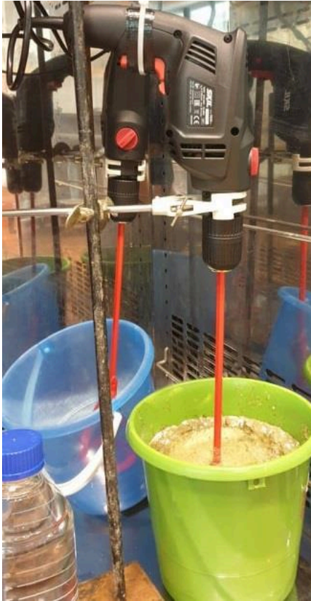
Figure 1. a) Picture of the enzyme pre-treatment set-up.