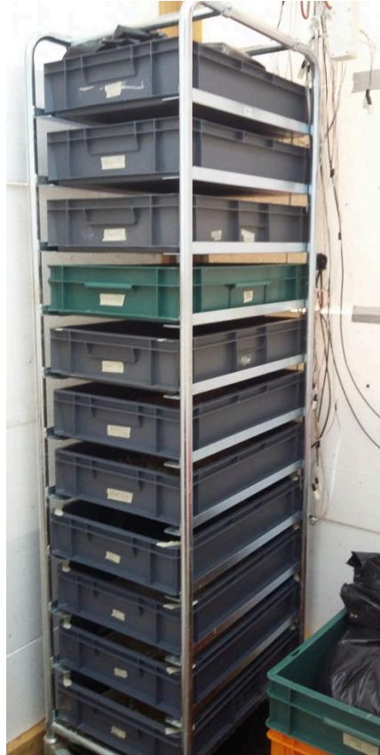
b) Picture of the experimental set-up for fungi and ammonia pre-treatment and BSFL composting placed, inside a tent.